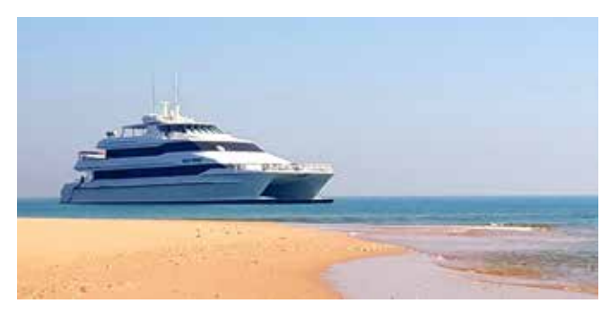
Day 1: Depart Darwin aboard MV REEF PRINCE

Our Charter Bus will greet you at your accommodation and arrange for your transportation to Reef Prince. Once aboard the vessel your friendly crew will settle you into your new home for the next 7 nights.