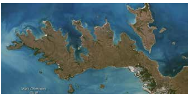
Day 5: Breakfast within the ecology of Trepang Bay

Up early to watch the sun rise over Trepang Bay. After a healthy breaky we'll hop in our big safe Tenders and scoot up one of the many creek systems that feed into Trepang Bay. Flick a lure or bring your camera and discover the ecology that awaits the morning explorer. Creek systems open into vast wetlands fringed by mangroves and pandanas. Arnhem Lands' tropical wonders await to awaken your senses.