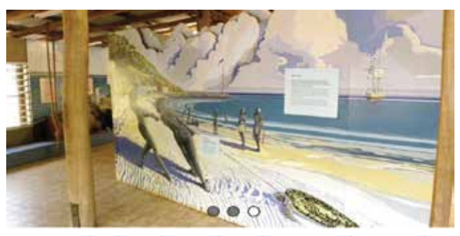
Day 2: Black Point Cultural Centre then cruise to Goulburn Islands

Departing Croker Island we'll cruise through the evening to Grant Island.