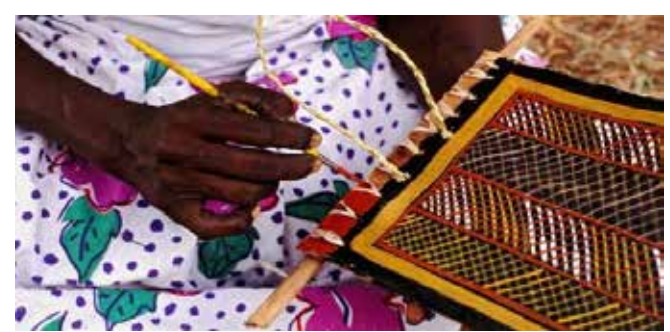
Day 7: Awake in the spiritual Tiwi Island - Apsley Straight.

Tonight we'll share photographs while we remain nestled within the arms of Trepang Bay.