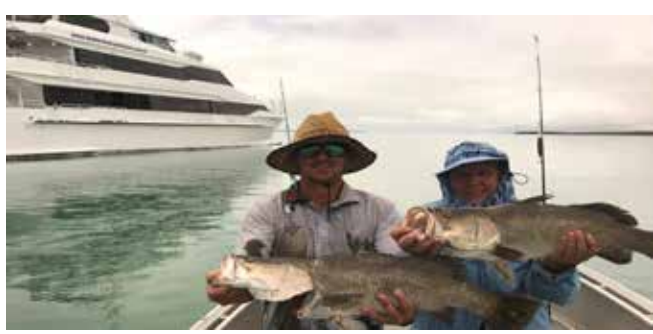
Day 6: Arnhem sunrise

Approx. 15,000 years ago rising sea levels, at the end of the last ice age, cut off Bathurst and Melville Islands from mainland, and created Aspley and Dundas Straits. In relative isolation distinctive Tiwi culture began to evolve. Tiwi people believe they are created by their spirit ancestors. Tiwi meaning "we, the only people".