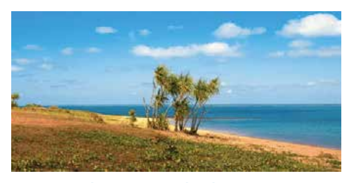
Day 4: Awake at Grant Island.

In the afternoon we go ashore to explore the failed settlement of Port Essington.