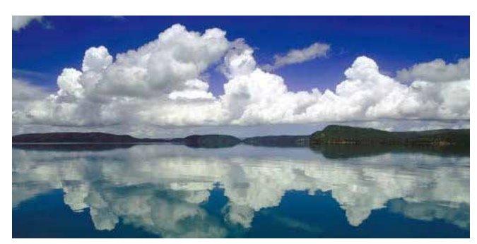
Day 6: Cruise to Darwin

You may opt to have a fishing excursion or go ashore and view the 36m tall light house.