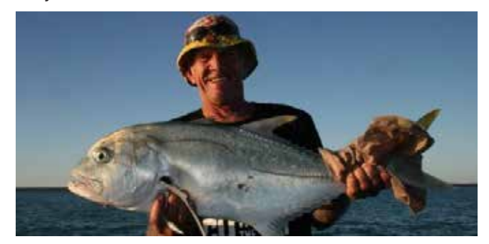
Day 3: Awake in beautiful Somerville Bay to explore and fish.

Today we start your Arnhem Land cruise and depart the capital of the Northern Territory - Darwin and Head North to the Coburg Peninsula. On route we will use our masters experience to enjoy our first fishing expedition in our tenters and go in search of some tasty fish for the table.